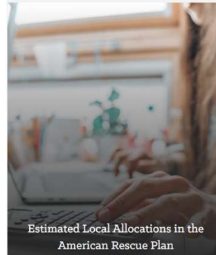
Estimated Local Allocations in the American Rescue Plan