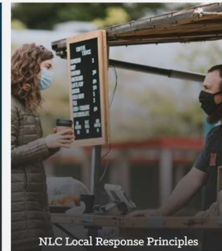
NLC Local Response Principles