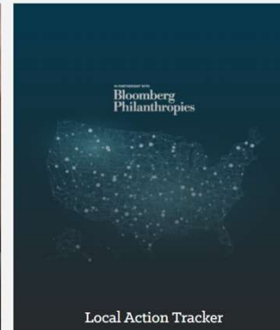
Local Action Tracker