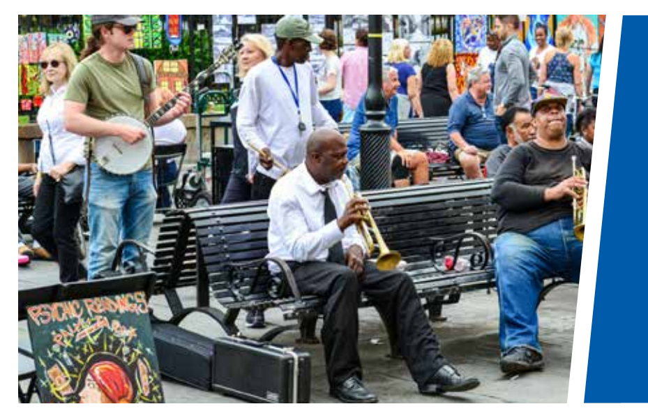
A group of men play jazz music as people sit in Jackson Square in the French Quarter of New Orleans, Louisiana.

Beginning in 2016, in the city that once housed one of the country's largest slave markets, Mayor Mitch Landrieu directed the city's Deputy Mayor for Citywide Initiatives to create a process that would build racial equity into the fabric of city government. "Because of race, we are too often a block away from each other but a world apart," said Mayor Landrieu. Key to designing the strategy was identifying the structural inequities experienced by the city's residents and the institutional approaches that can address them. The city's Director of Equity Strategy led a small team that collected and analyzed data from a broad cross-section of the city, holding four community listening sessions and hundreds of interviews and focus groups. Through a snowballing set of conversations, stakeholders answered questions like "What do you see as the key