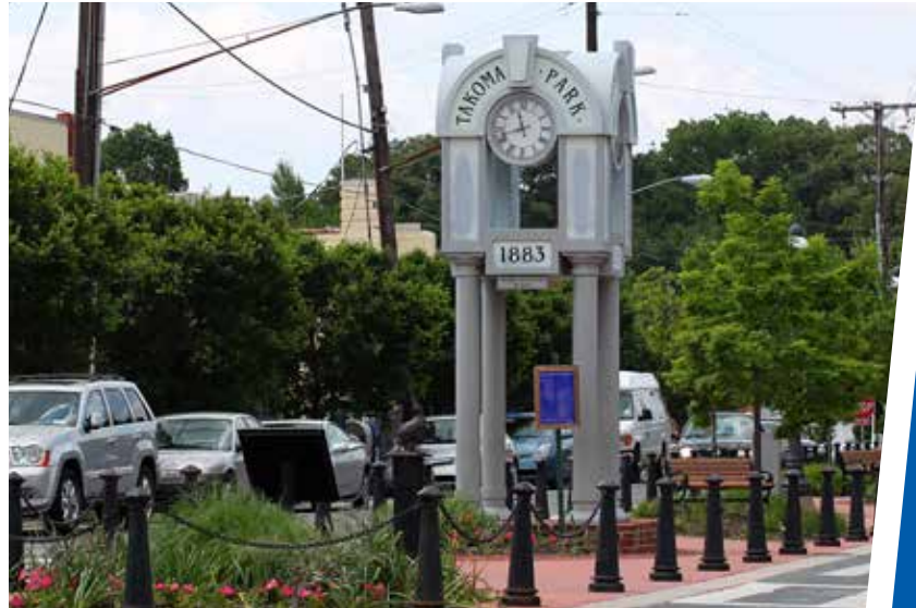
Downtown Takoma Park where residents gather for their farmer's market and other festivals.

Based on a growing understanding of how inequities have become embedded throughout government institutions, the city council began efforts to embed an intentional focus on racial equity into the day to day business and decision making of the council and city departments. "Diversity is about numbers but to make sure we are truly inclusive takes ongoing work, including recognizing the history of racism in our country and how racial inequities have become institutionalized in the policies and practices of many agencies,