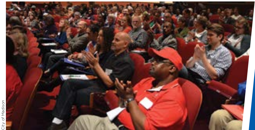
Mayor Soglin's Roundtable on February 20, 2017

The city made a real commitment to develop structures and tools to achieve this mission, by putting resources into staffing a citywide initiative, adequately training all staff to meet these goals and adjusting community engagement to build an equitable and responsive government.