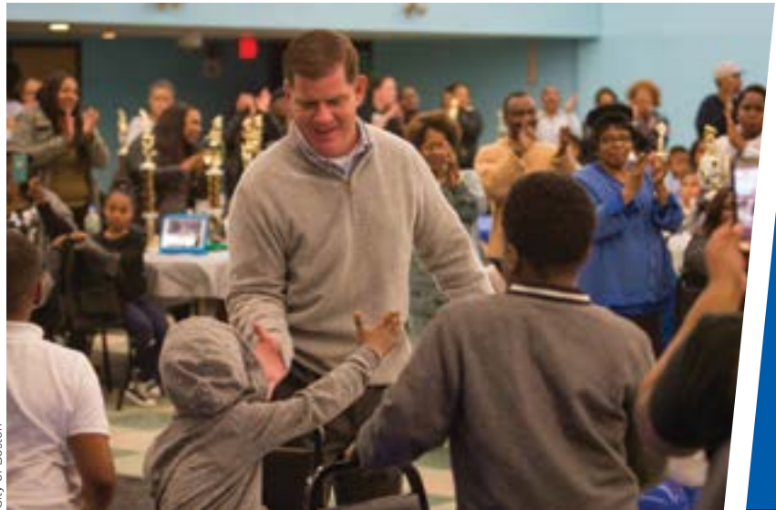
Mayor Marty Walsh at a Community Conversation

A number of efforts were simultaneously developed under BPHC's Racial Justice and Boston Health Equity Initiative , including 22 hours of mandatory racial justice training for all staff, 5-year Health Equity Goals, a revised organizational mission and vision, and a language justice initiative. As a key part of this strategy, more than 400 staff were surveyed and more than 20 staff were trained as facilitators for internal racial justice workshops. After BPHC rolled out the training series in