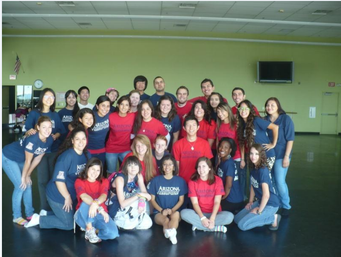
Homecoming Flash Mob Participants 2011