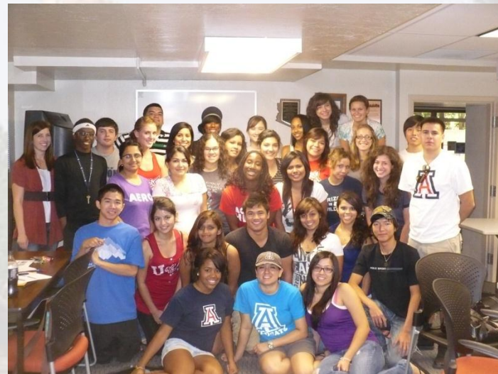
Cubs to Wildcats Volunteers