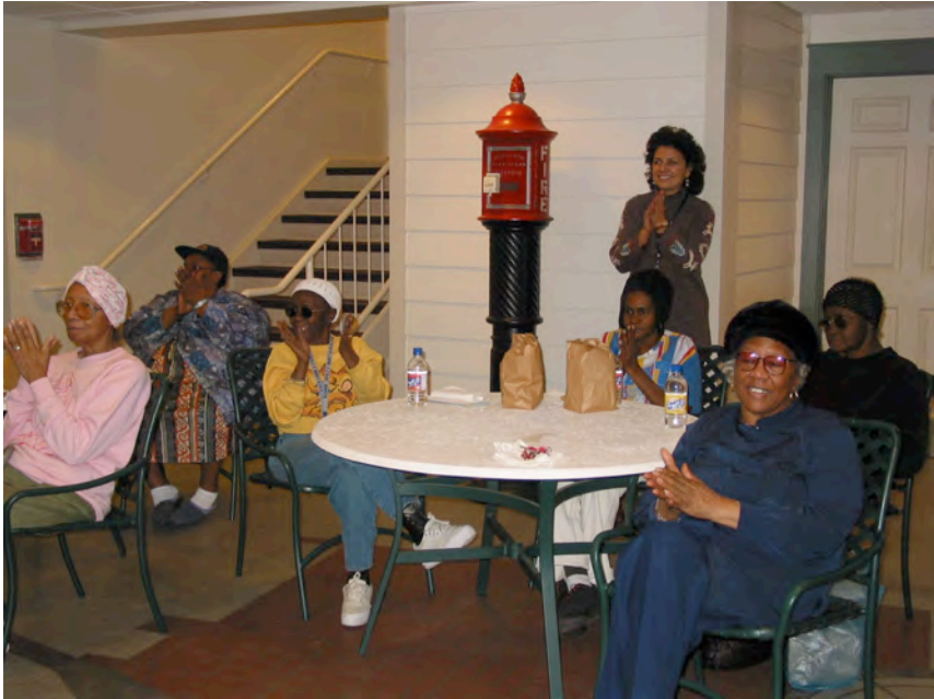
Residents of Lapham Park enjoying an activity at the “Town Square”

Following are photos of the renovated Lapham Park Facility, the area is known as the “town square” and was funded with over $1.3 million in public and private sector funding. These financial partners included the: Helen Bader Foundation, Greater Milwaukee Foundation, Jane B. Pettit Foundation, M & I Foundation, Milwaukee County Community Development Block Grant Office, and U.S. Department of Housing and Urban Development.