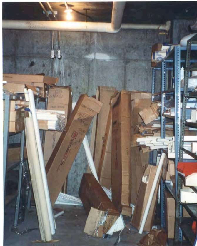
The space as it was prior to the Lapham Park Venture

Created in 1991, the Lapham Park Venture became a synergy of public, private, and nonprofit investment, drawing on the contributions of experts and practitioners in housing, medicine, and social services. HACM provided the infrastructure for the Venture and managed the renovation of the building space.